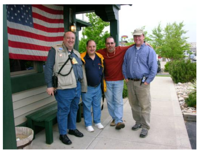
HoSARC goes to HamVention.