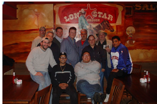
The brave HOSARC members who dared mother-nature to keep them away from another hamfest, and another round of steak and beer.